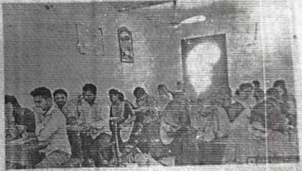
प्रश्नोत्तरी स्पर्धा में भाग लेते विद्यार्थी।