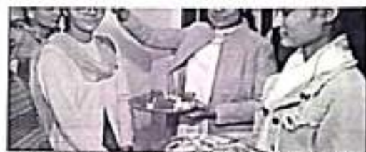
सदस्य: नए विद्यार्थियों के भरो 'ते शिक्षण वि' के समीचीन सहायक बनाने में ही उमरभर। उमरभर: मेरा बहुत निरपेक्ष

कार्यक्रम में अनेक विषयों पर चर्चा हुई, जिसमें शिक्षण विधियाँ, छात्र संघ, खेल-क्रीड़ा, और अन्य गतिविधियाँ शामिल थीं।